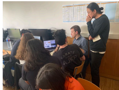
(Fig. 6 production work)