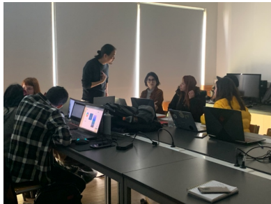
(Fig. 4 workshop image)

Programming workshops were held for local undergraduate and graduate students. After the icebreaking session, the participants were separated into 6 groups to work on their own productions. Programming was to be the medium used in the students' workshop assignment. Mr. Kondo explained how to use the "colors of the Olympic Games" effectively within their programming efforts.