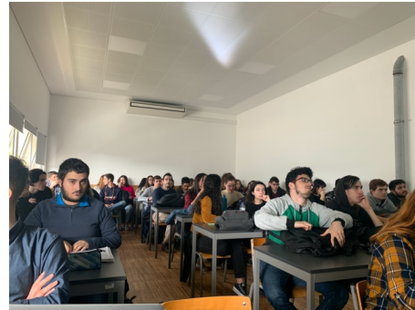
(Fig. 1 lecture image1)

A significant focus was the use of programming as a creative medium, providing a baseline knowledge of techniques and examples which would be used in the associated follow-on workshop.