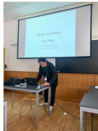
(Fig. 2 lecture image2)